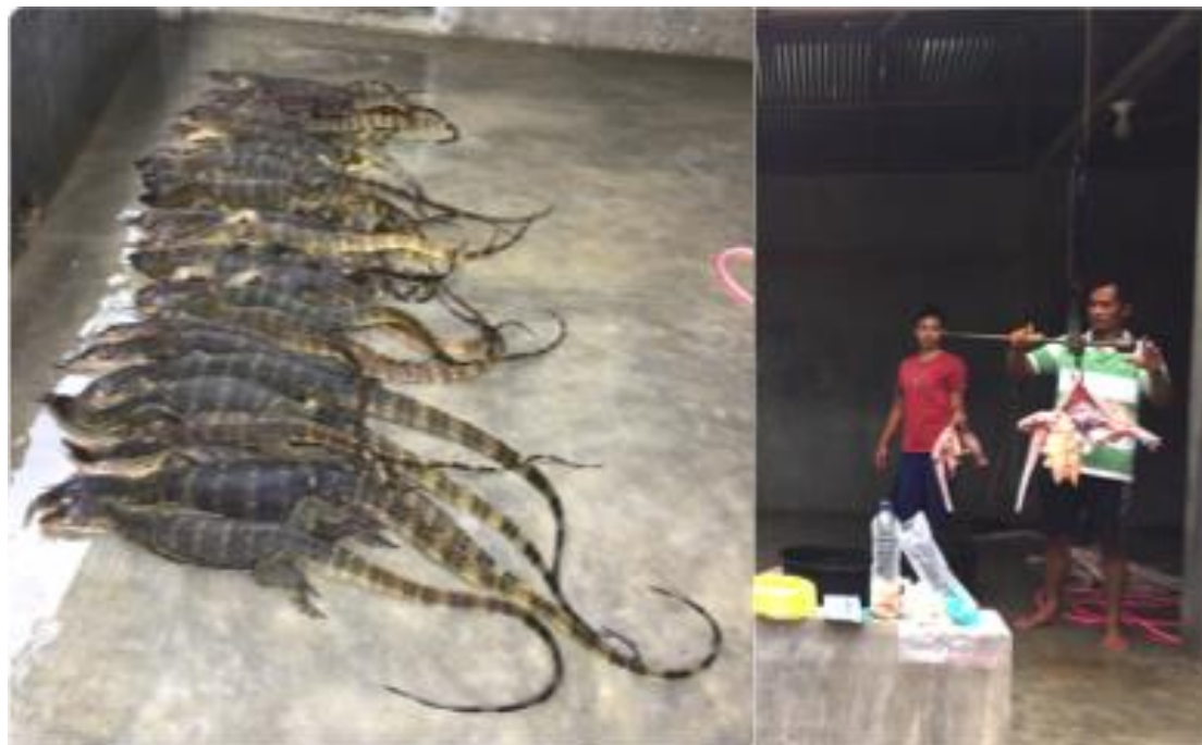
Figure 3. (a) Various sizes of Water monitor before skinning (b) Skinned lizards for subsistence and sale

We have the impression that only lizards of adult size were taken and processed in the abattoirs, although there is no regulation on body size limit for commercial harvest of Water monitor in Indonesia. Lizards of approximate SVL of 40.00 cm (males) and 48.00 cm (females) are mature individuals capable of reproduction (Shine et al. , 1998), therefore immature individuals did not seem to be harvested. Unless we know the sex of these lizards individually, we cannot estimate the reproductive status of these harvests. Figure 3 illustrates the different sizes of Water monitor taken in an abattoir.