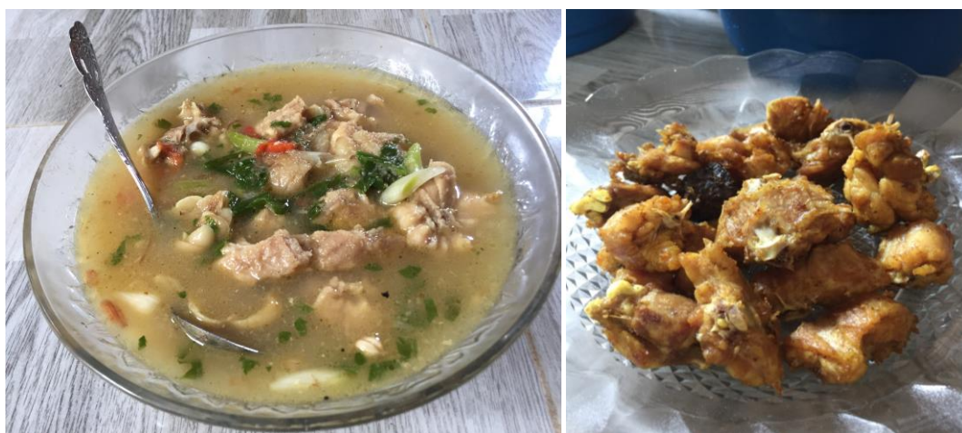
Figure 5. Water monitor meat, fat, and liver prepared by a Javanese family: soup (left) and deep-fired (right)

and skin production. Our hunter interviewees mentioned that they have actively hunted for Water monitors for commercial purposes since the beginning of 1990s. During this period of thirty years, they never found difficulty finding the animals in their neighboring areas such as plantations and wetlands. Some of these abattoirs even now have been passed on to run by the younger generation in the family such as sons and nephews. Thus, the trade of Water monitors has been a family business that seems to be a source of stable income for relatively long time.